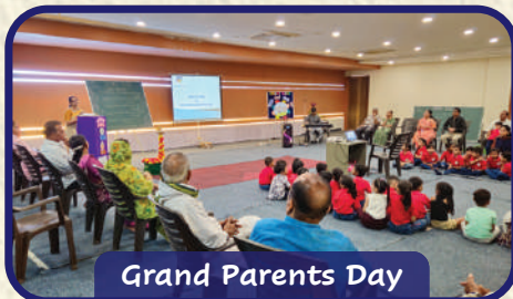
Grand Parents Day