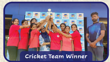
Cricket Team Winner