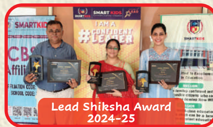
Lead Shiksha Award 2024-25