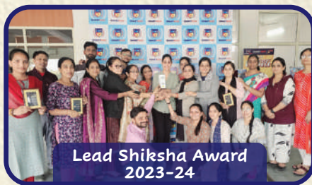
Lead Shiksha Award 2023-24

By engaging in competitions, students grow into well-rounded, talented and confident individuals.