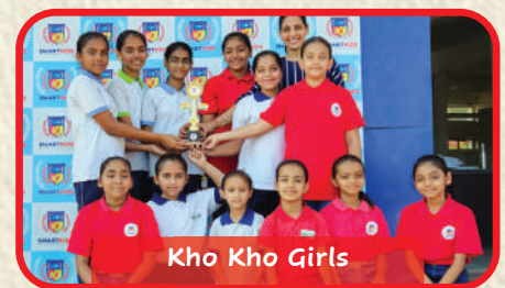
Kho Kho Girls