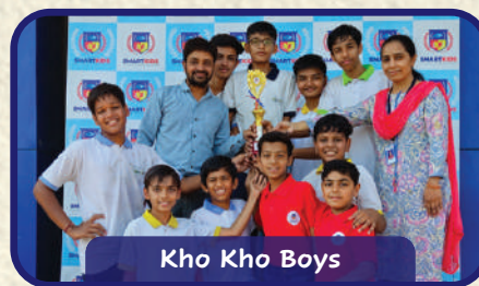
Kho Kho Boys