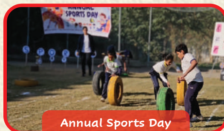
Annual Sports Day