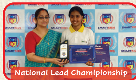
National Lead Championship