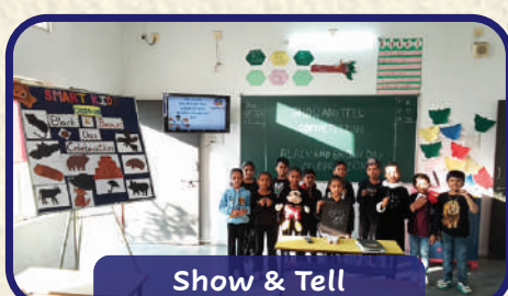
Show & Tell