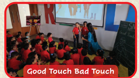
Good Touch Bad Touch