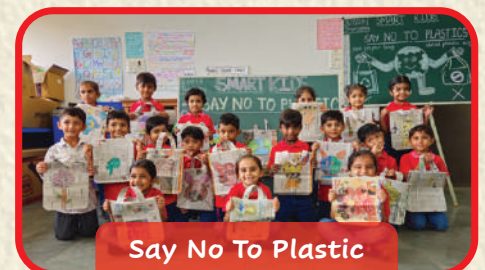
Say No To Plastic